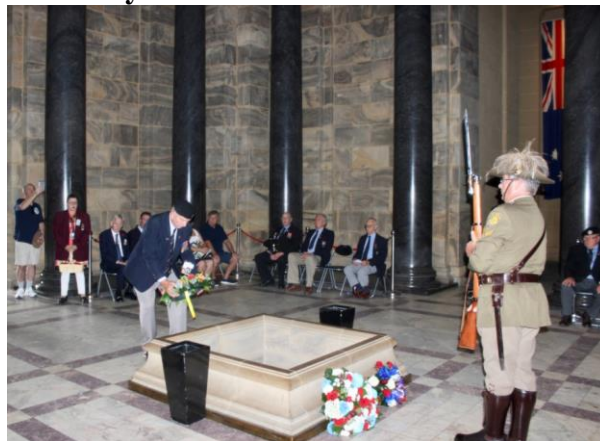
Wreath laying in the Shrine Sanctuary