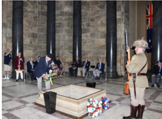
Wreath laying in the Shrine Sanctuary