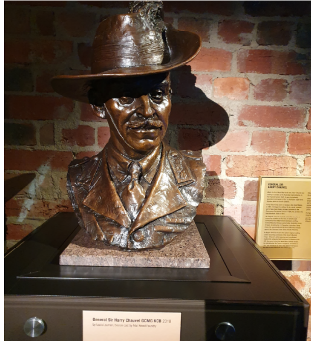
This outstanding bust of General Sir Harry Chauvel, GCMG, KCB is currently on display in Melbourne's Shrine of Remembrance.