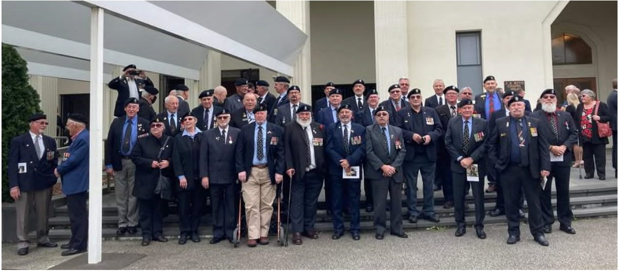
A large number of Black Hats were in attendance to pay their respects to a great bloke.