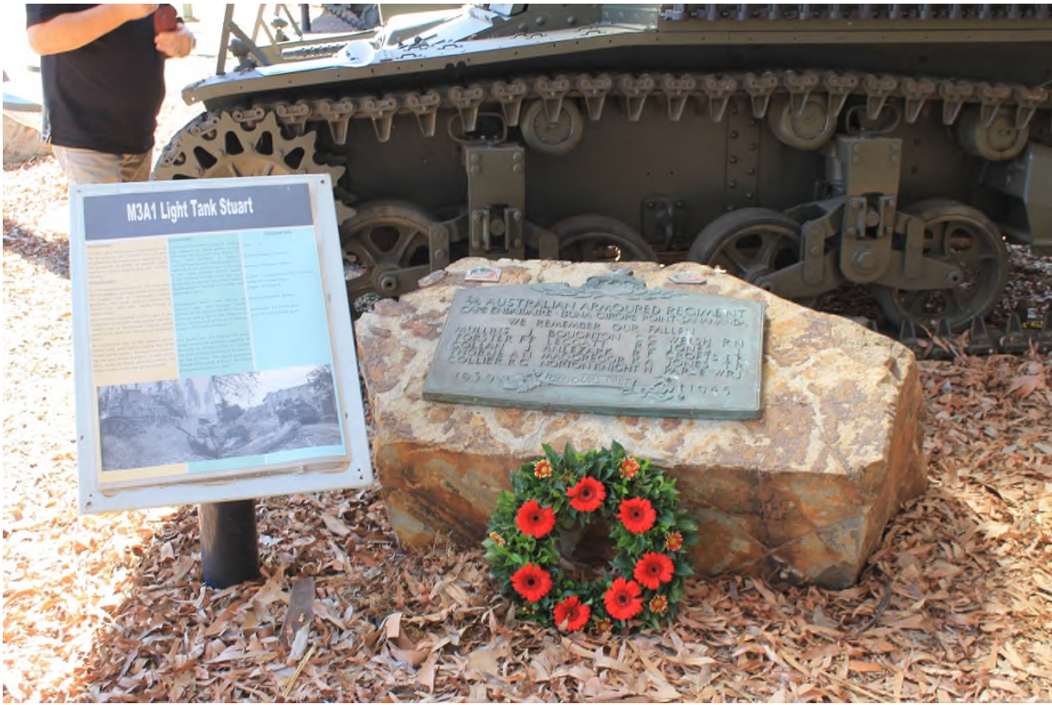
2/6th Armoured Regiment Memorial featuring a General Stuart tank like they used at Buna.