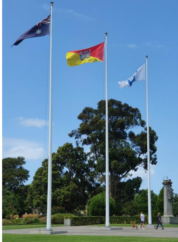
Our flag, first flown at the Shrine in 2012, flying proudly beside the National Serviceman's Association flag on 12 Feb 23.