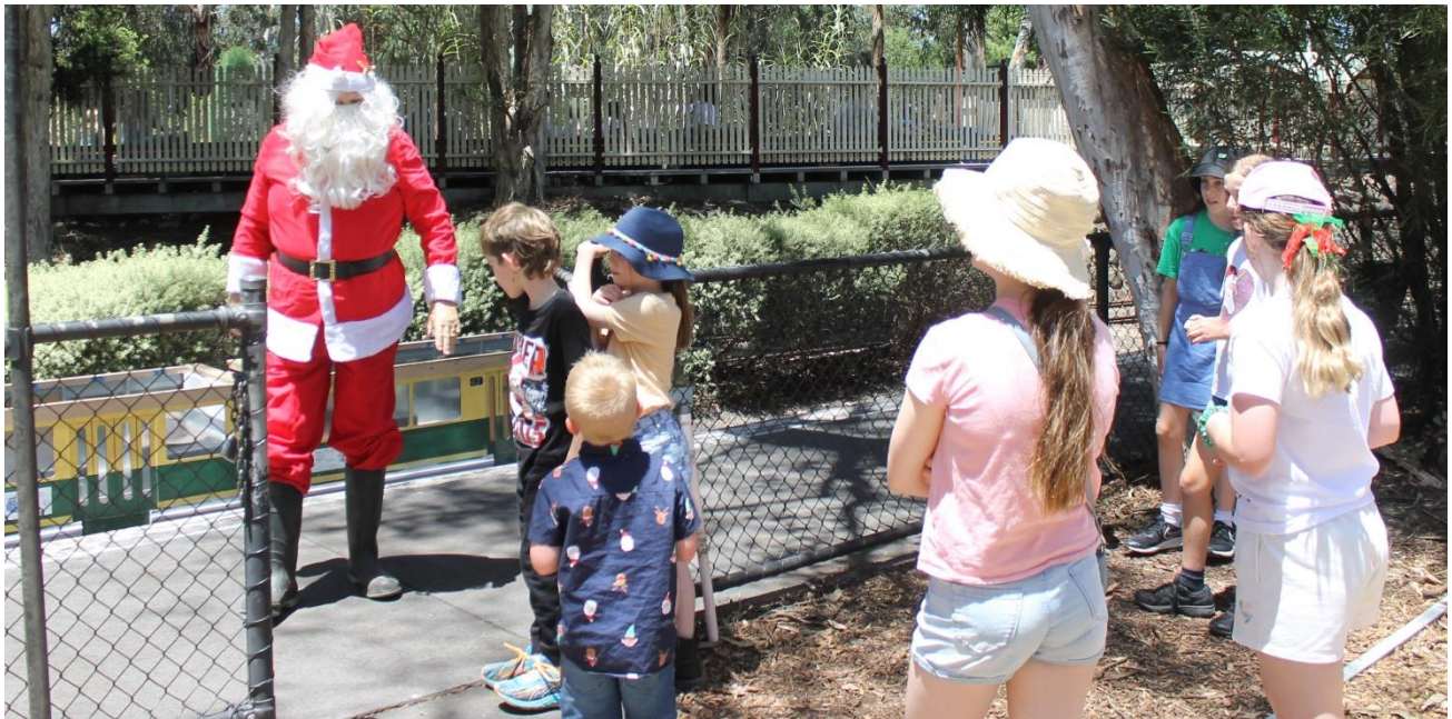
As usual Santa arrived on his own special, this year it was a Melbourne tram.