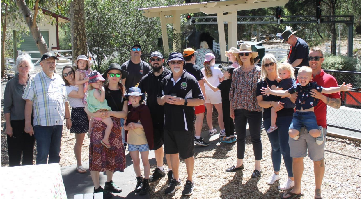
A small section of the madding crowd at Meadmore Junction.