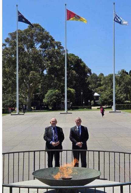
Our flag, first flown at the Shrine in 2012, flying proudly beside the National Serviceman's Association flag on 11 Feb 24.